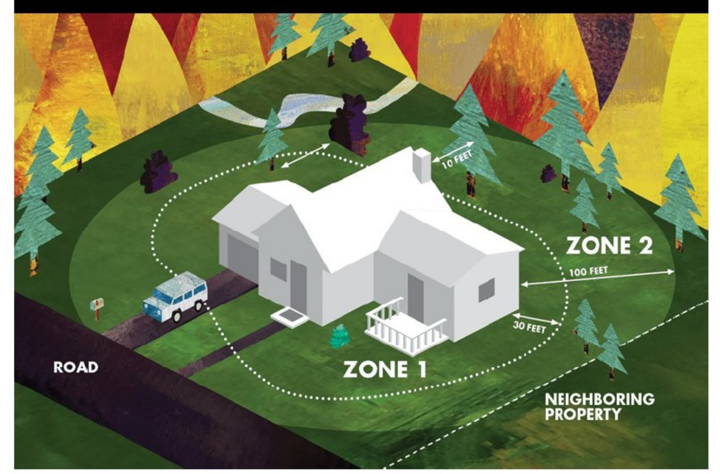
DEFENSIBLE SPACE ZONES

Are you in need of assistance to help with your defensible space? There is an assistance program through the Tehama Conservation Fund. To apply please visit www.tehama-conservation-fund.org or call 530-727-1280 for more information.